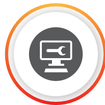
INFORMATION Technology Tech Mahindra Ltd.