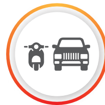
AUTOMOTIVE Mahindra CIE Automotive Ltd.