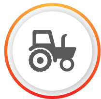
TRACTOR Mahindra & Mahindra Ltd.

Learn more about Mahindra on www.mahindra.com /Twitter and Facebook: @MahindraRise