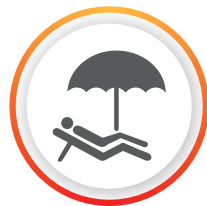
HOLIDAYS Mahindra Holidays & Resorts India Ltd.