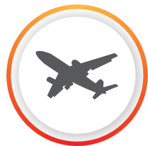
AEROSPACE Mahindra Aerospace