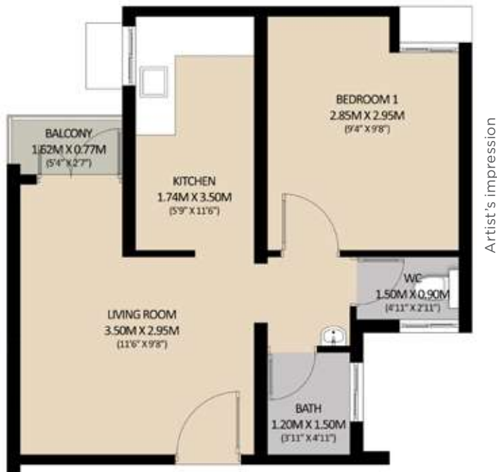
1BHK Unit Plan (Typical)