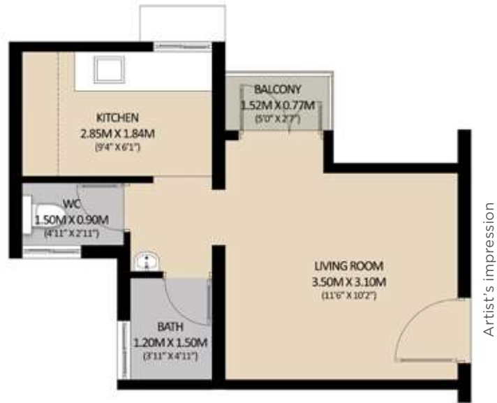
Studio Unit Plan (Typical)